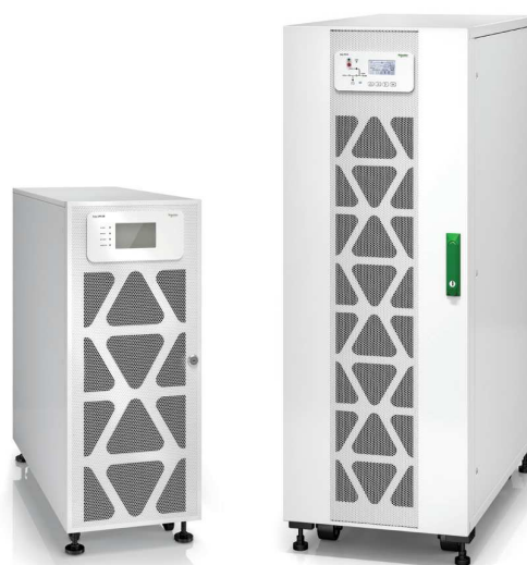
100 kVA Easy UPS 3M for external batteries