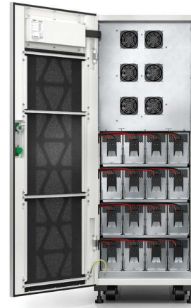
40 kVA Easy UPS 3S with internal batteries