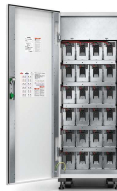
Modular battery cabinet for extended runtime requirements