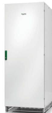
Classic battery cabinet with factory installed long-life batteries, for quick and easy installation on-site