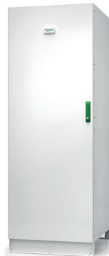
Empty battery cabinet for battery installation on-site