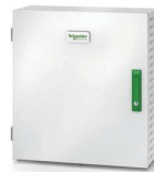
Parallel maintenance bypass panel